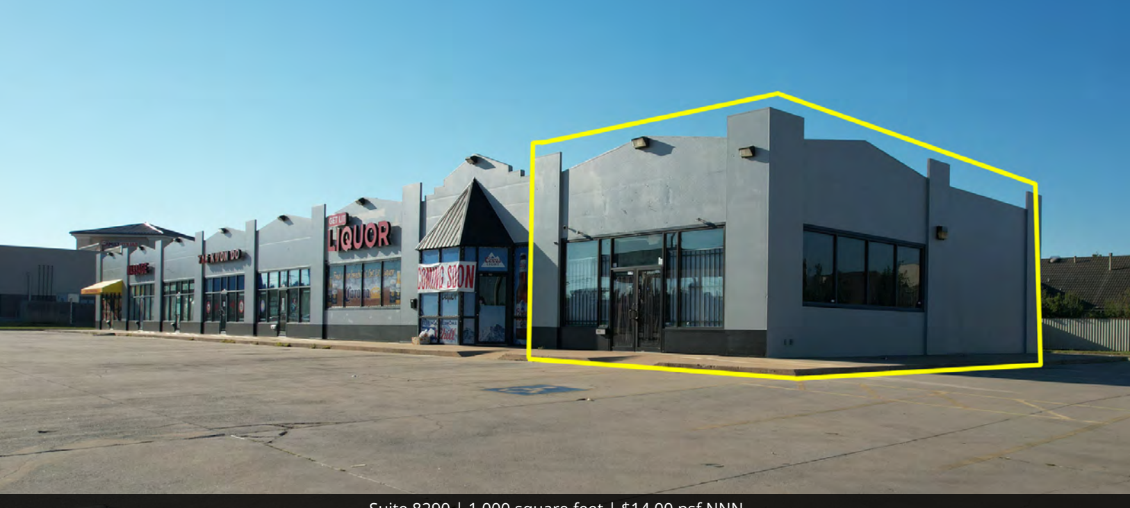
Suite 8290 | 1,000 square feet | $14.00 psf NNN

ROSHA WOOD 405.239.1219 rwood@priceedwards.com priceedwards.com