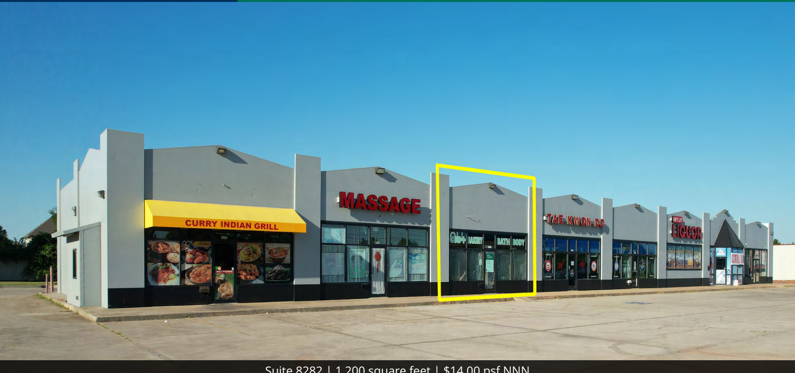
Suite 8282 | 1,200 square feet | $14.00 psf NNN

8278 NW 39th Expressway, Bethany, OK 73008